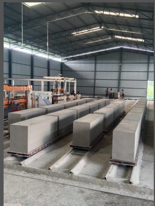
Premier Series Capacity : 20 CBM – 100 CBM(Per Day)