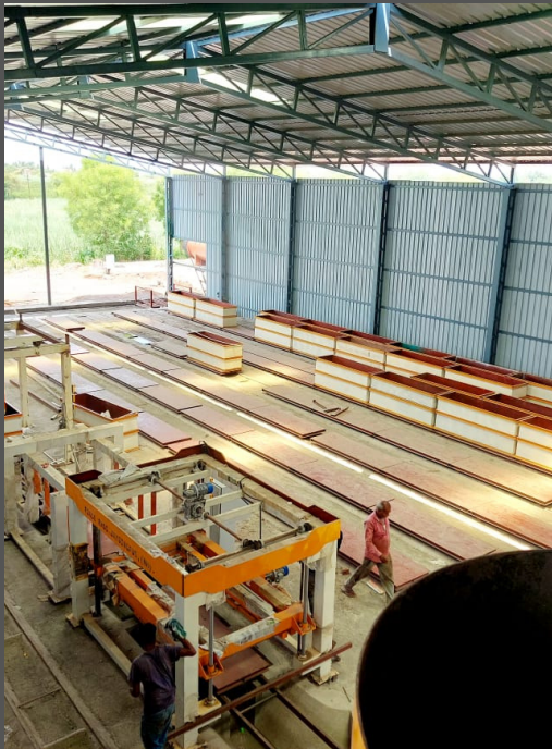
Jumbo Series Capacity : 100 CBM – 500 CBM(Per Day)