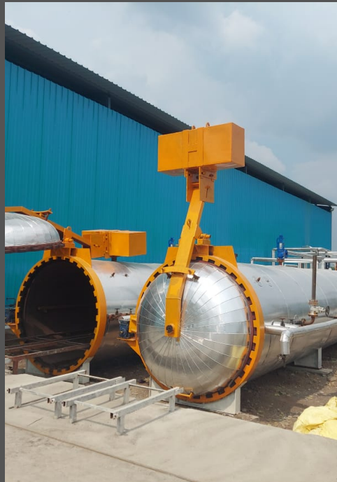
Classic Series Capacity : 30 CBM – 200 CBM(Per Day)