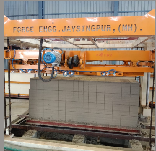
WIRE CUTTING TECHNOLOGY